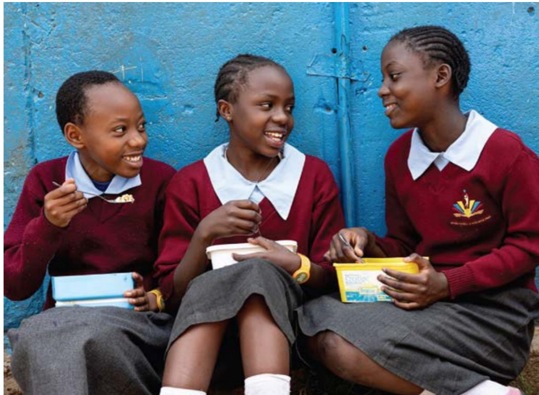
Food4Education's school feeding programme ensures that learners receive the nutrition they need to attend school regularly and participate actively in learning.