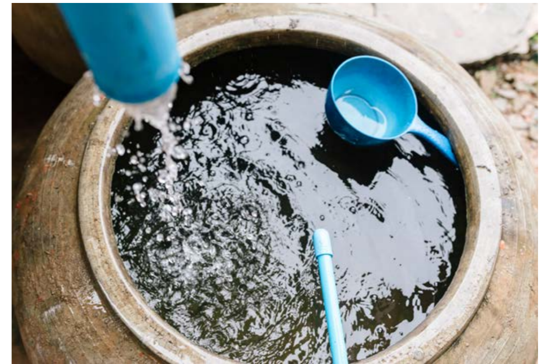
In Cambodia, traditional clay jars are used for rain-water collection.