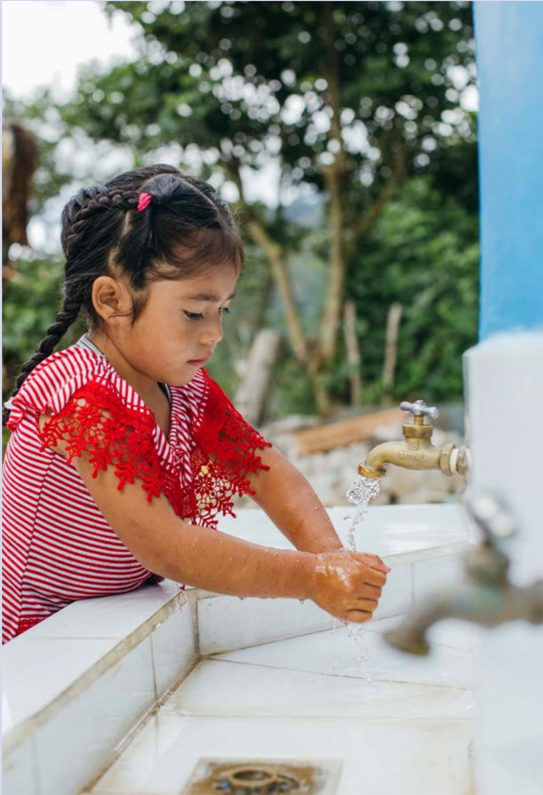
The daughter of Santana, a water committee member in the rural village of Lagunitas in Santa Cruz del Quiché, Guatemala.

people impacted through water, sanitation and hygiene initiatives in 2025. 1