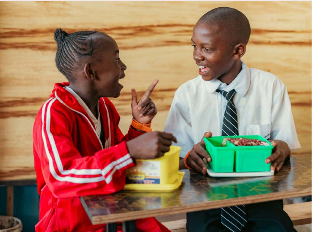
A nutritious lunch helps students stay engaged in the classroom, improving concentration and supporting better educational outcomes.

Over 1.8 million people reached with improved access to nutrition in 2025. 4