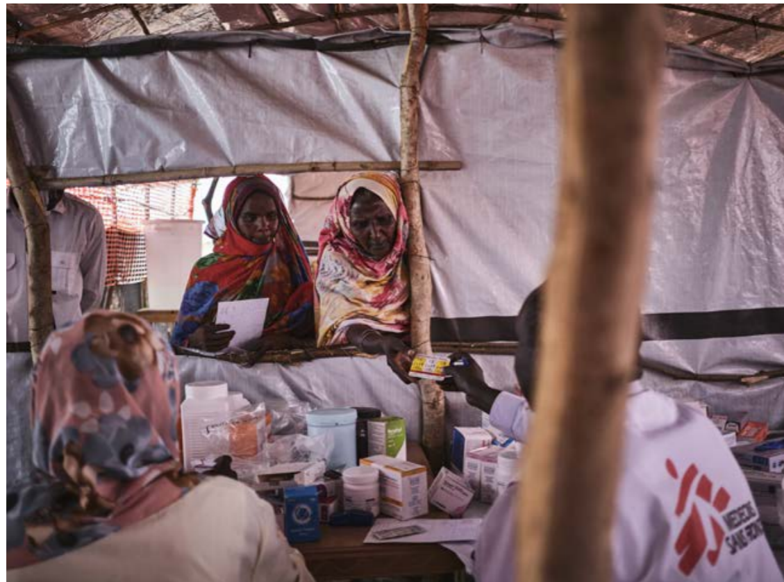
Emergency project in Renk, South Sudan, supporting Sudanese refugees. A woman receives medication from an MSF worker in Jerbana,