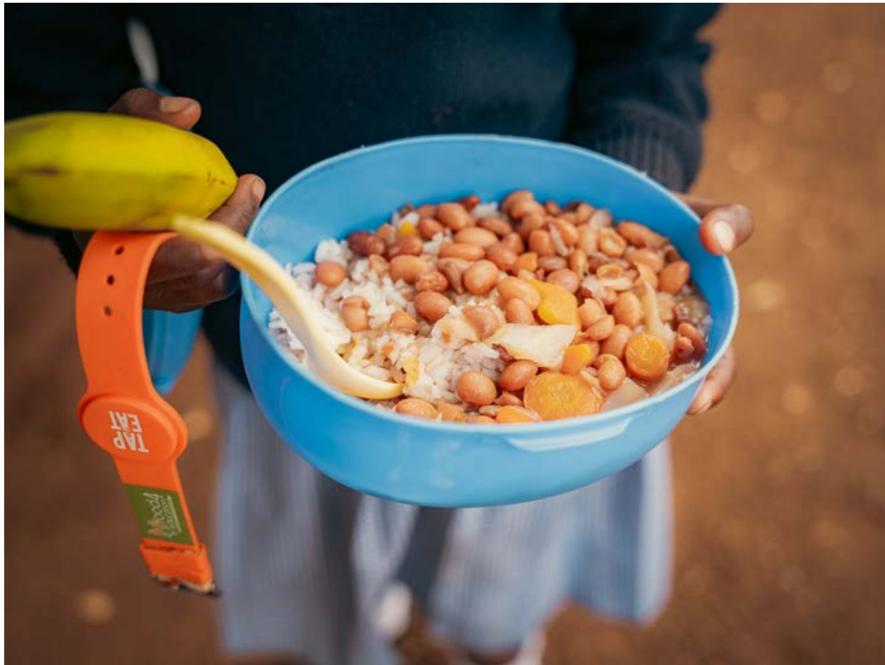
Through school feeding programmes, students receive the nourishment they need to learn, grow and reach their full potential.

“ Our goal is to reach 1 million children by 2027. Every partnership, every meal served and every person who believes in this mission brings us closer to a future where no child has to learn on an empty stomach. By feeding children today, we are giving them the chance to unlock their full potential for life. ”