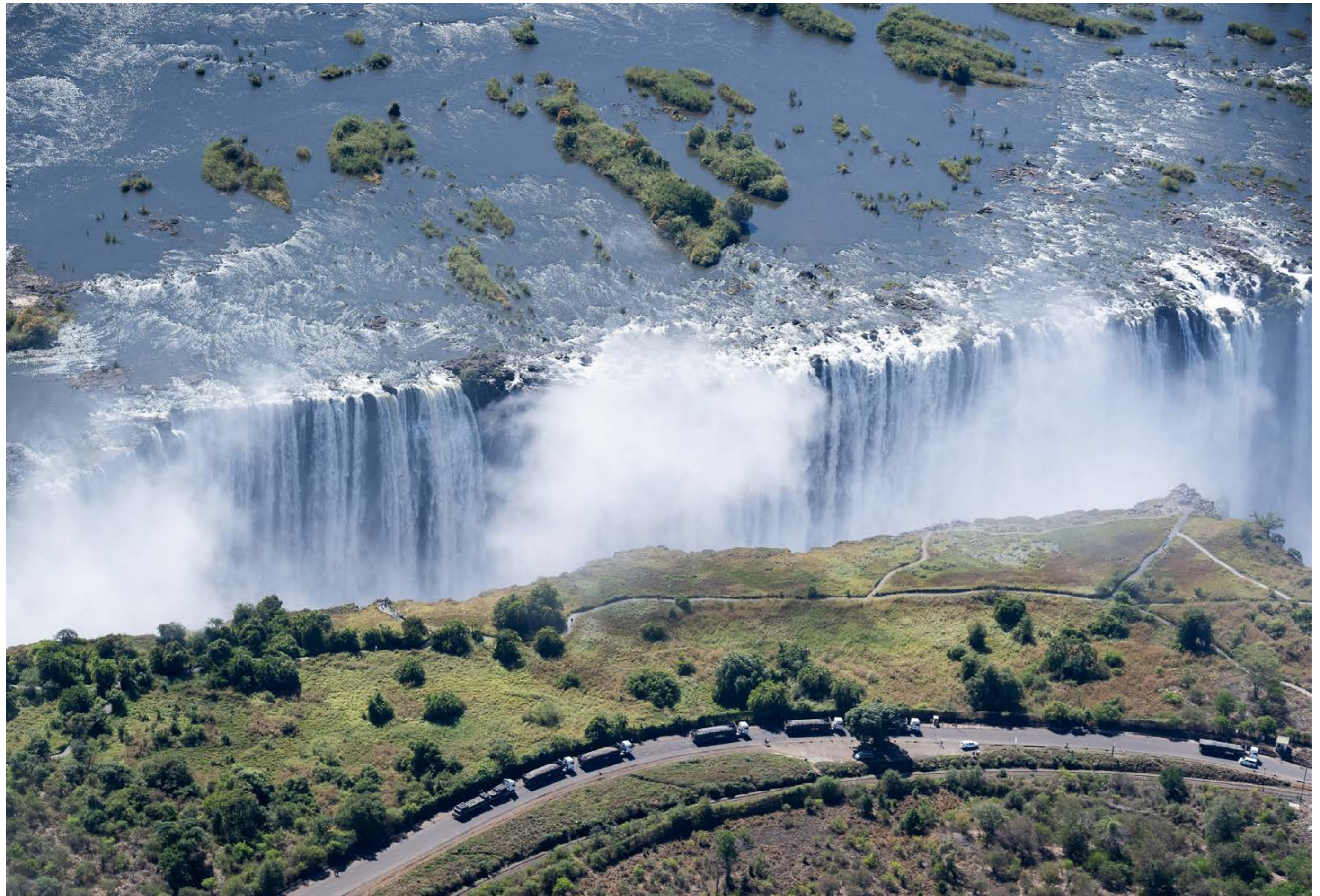
The Victoria Falls, one of UNESCO's Seven Wonders of the World, outside

Livingstone, Zambia. They occasionally run dry late in the year.