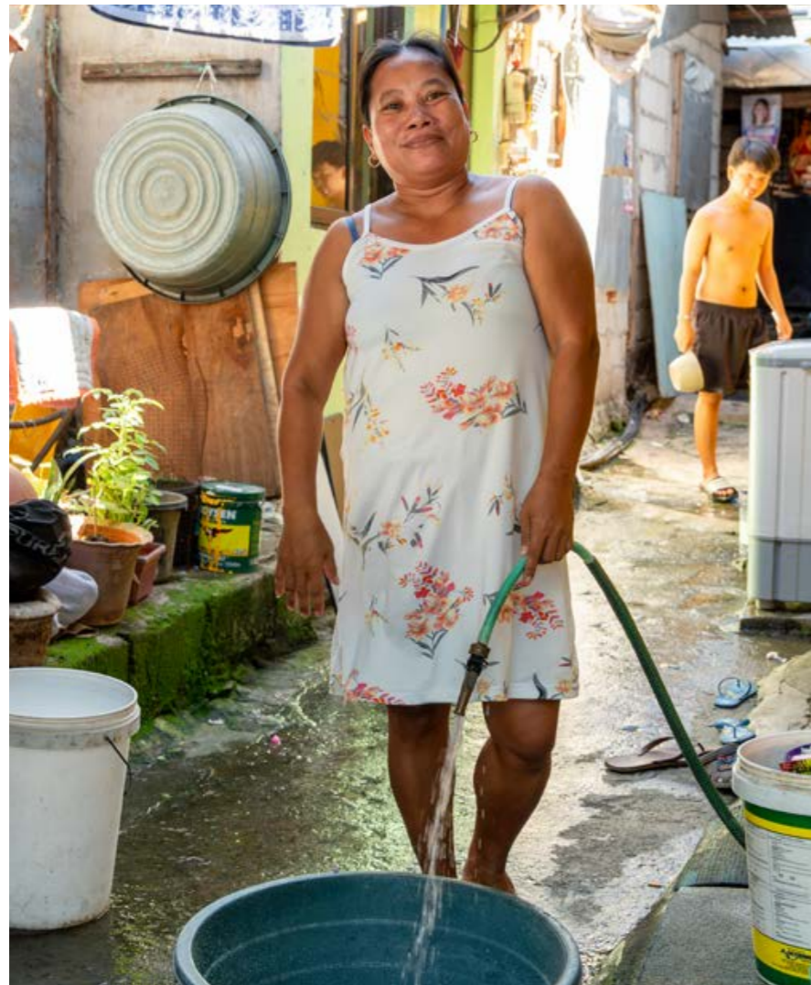
Better With Water is changing lives in Manila's underserved communities by addressing one of their most pressing challenges: access to clean and affordable water.

Join us for a field visit to the Philippines to witness Better With Water's work.