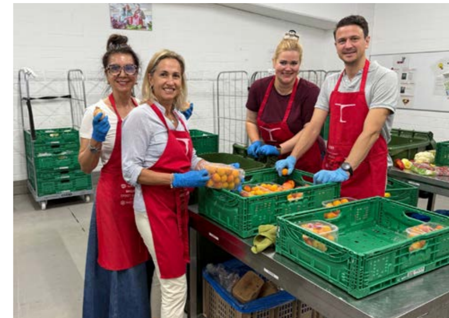
Colleagues from the Zurich office sorted donated fruit and vegetables with Tischlein-Deck-Dich , ensuring the high quality of produce for distribution to people in need in Switzerland.