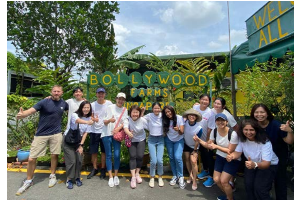
Colleagues in Singapore participated in a rice planting activity alongside beneficiaries from Club Rainbow, an organisation supporting children with chronic illnesses.