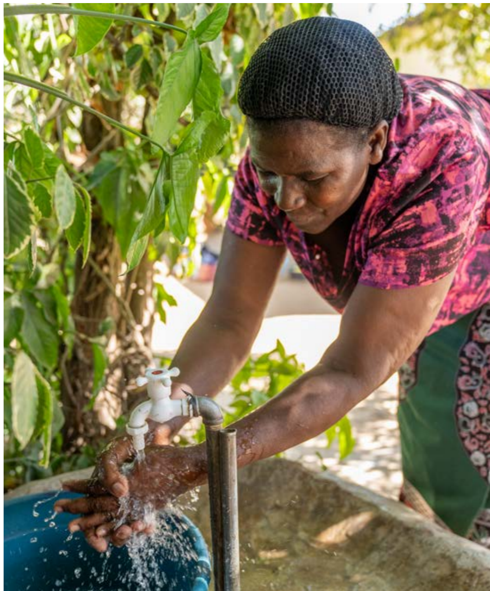
In Southern Zambia, where WSUP works, one tap (household connection)

In Southern Zambia, Water & Sanitation for Urban Populations (WSUP) focuses on protecting water resources and providing sustainable, continuous access to clean water for two low-income communities in Livingstone. The project has strengthened the local utility's capacity to reduce non-revenue water caused by leaks in the network and non-payment for water used. Additionally, 10 kilometres of pipe network have been repaired, providing new and improved water access to 14,800 residents. As a result, 85% of households now have continuous access to water, while the remaining 15% have around 13 hours of supply.