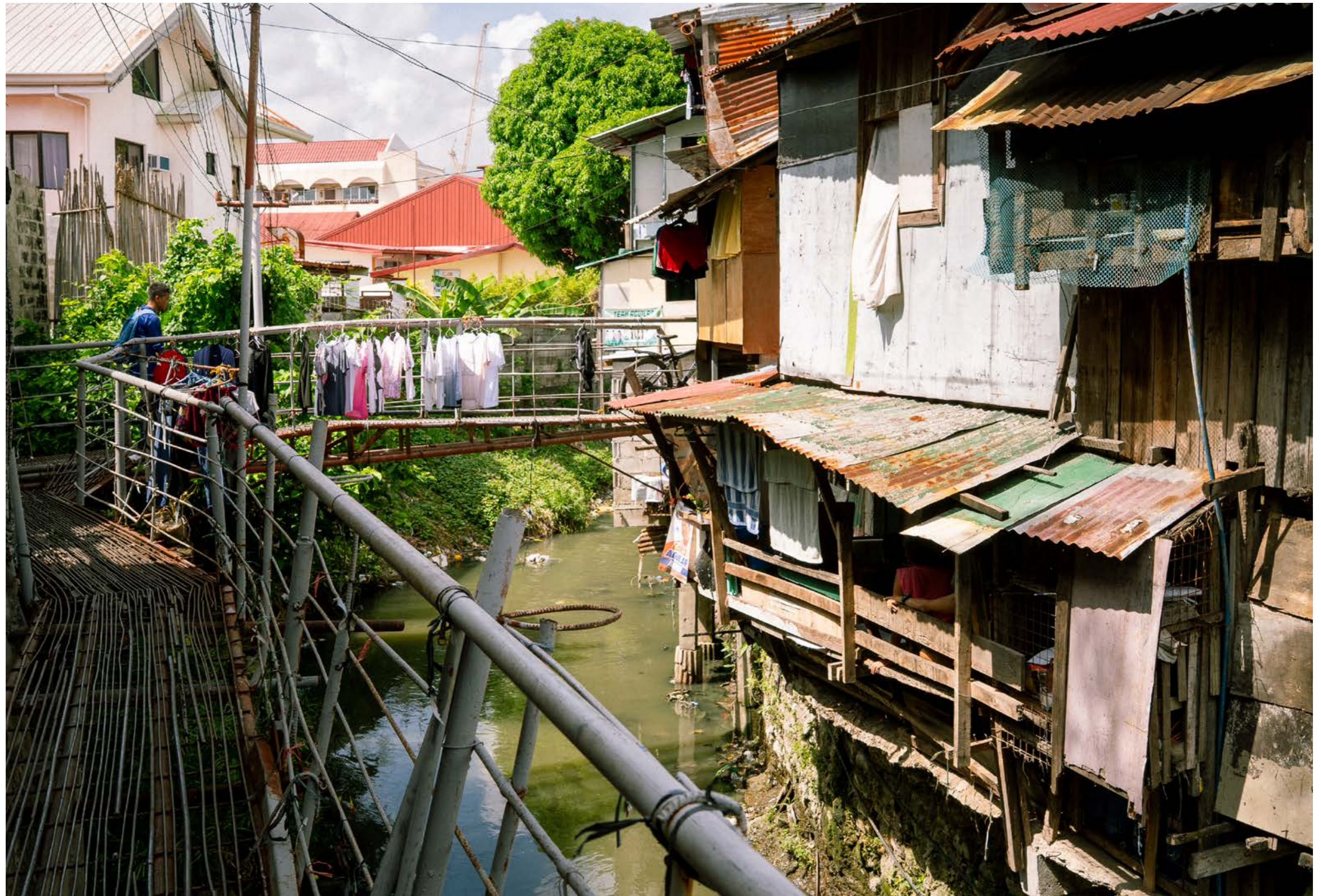
Urban settlement of Molave, in the heart of Manila, capital of the