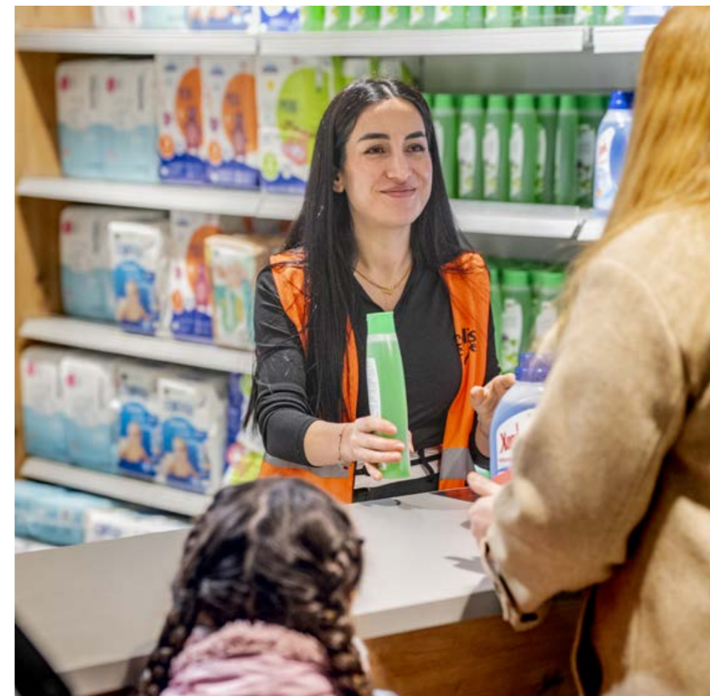
A Colis du Cœur volunteer welcomes a family coming to collect food and essential items, illustrating solidarity with people in need.