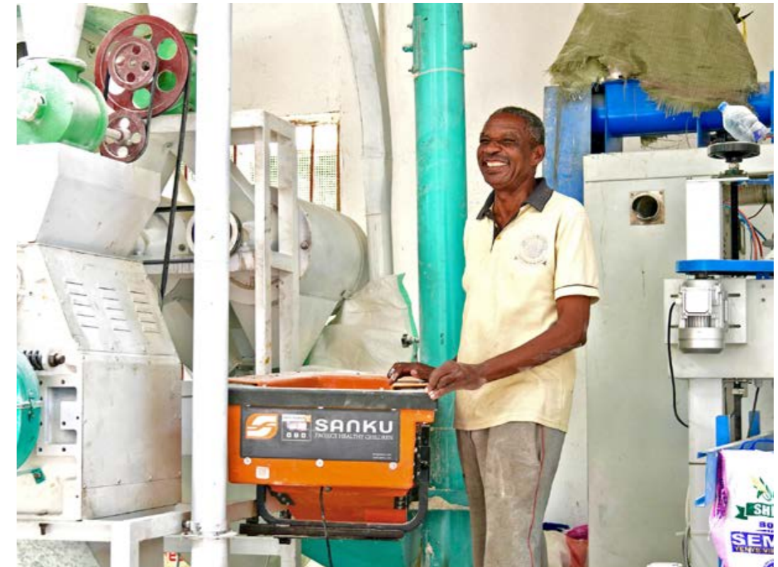
A miller stands by his Sanku 'dosifier' in Tanzania.

Over 1,100 partner mills in Tanzania, reaching 1.8 million people with access to fortified flour.