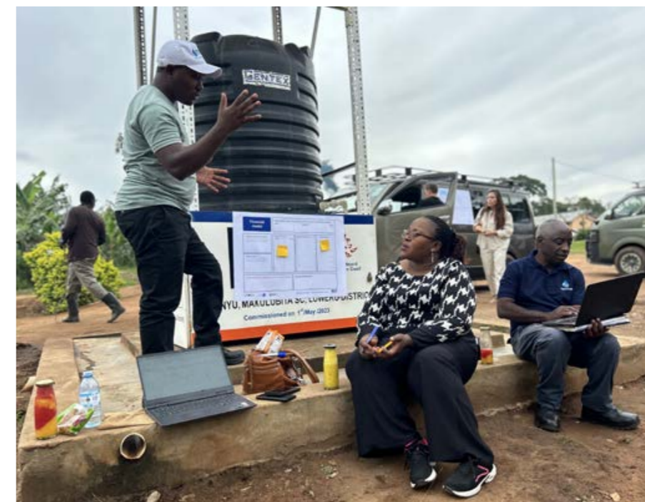
Engaged water entrepreneurs discuss how to expand their services to more people in Uganda.

of them are now engaged in discussions with impact investors.