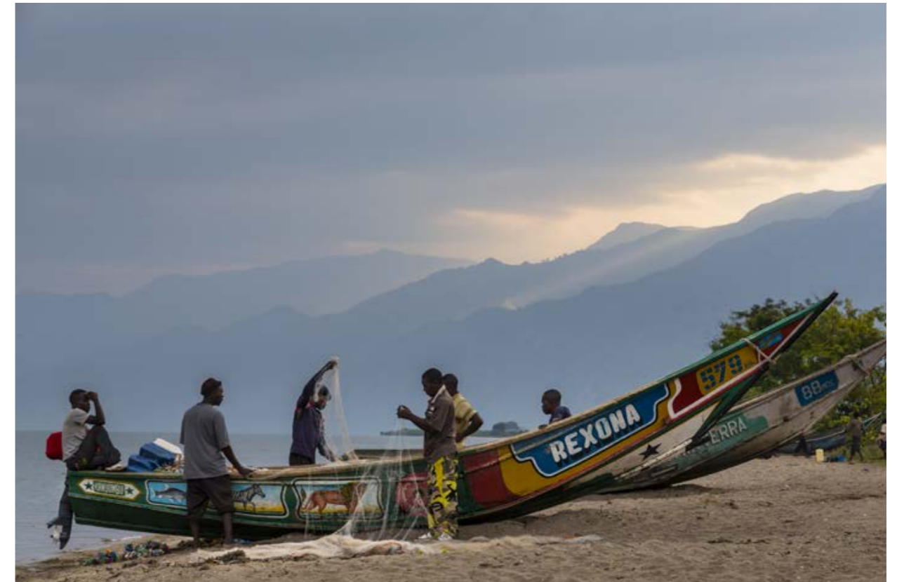
Villagers tend to their nets on the northern shore of Lake Edward, Democratic Republic of Congo.