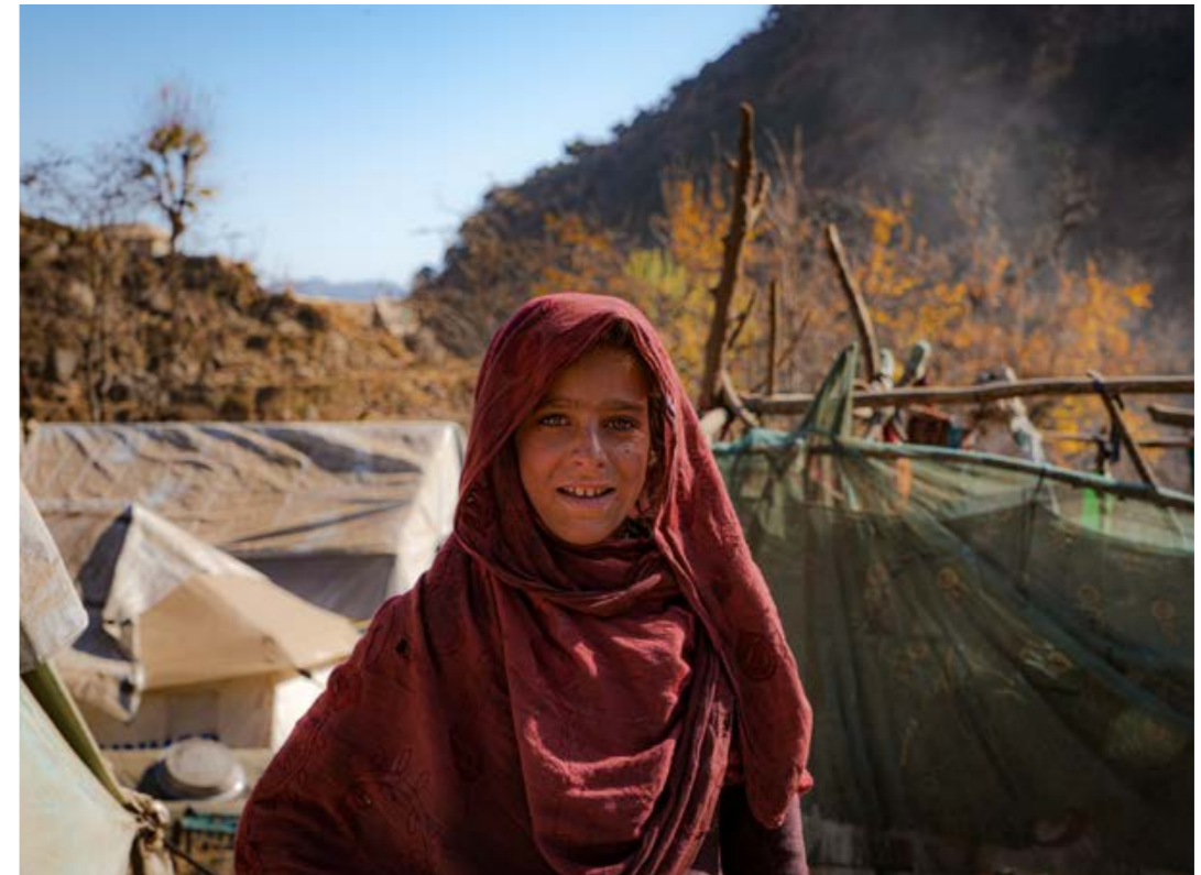
A girl from an earthquake-affected community poses for the camera in Kunar, Afghanistan.