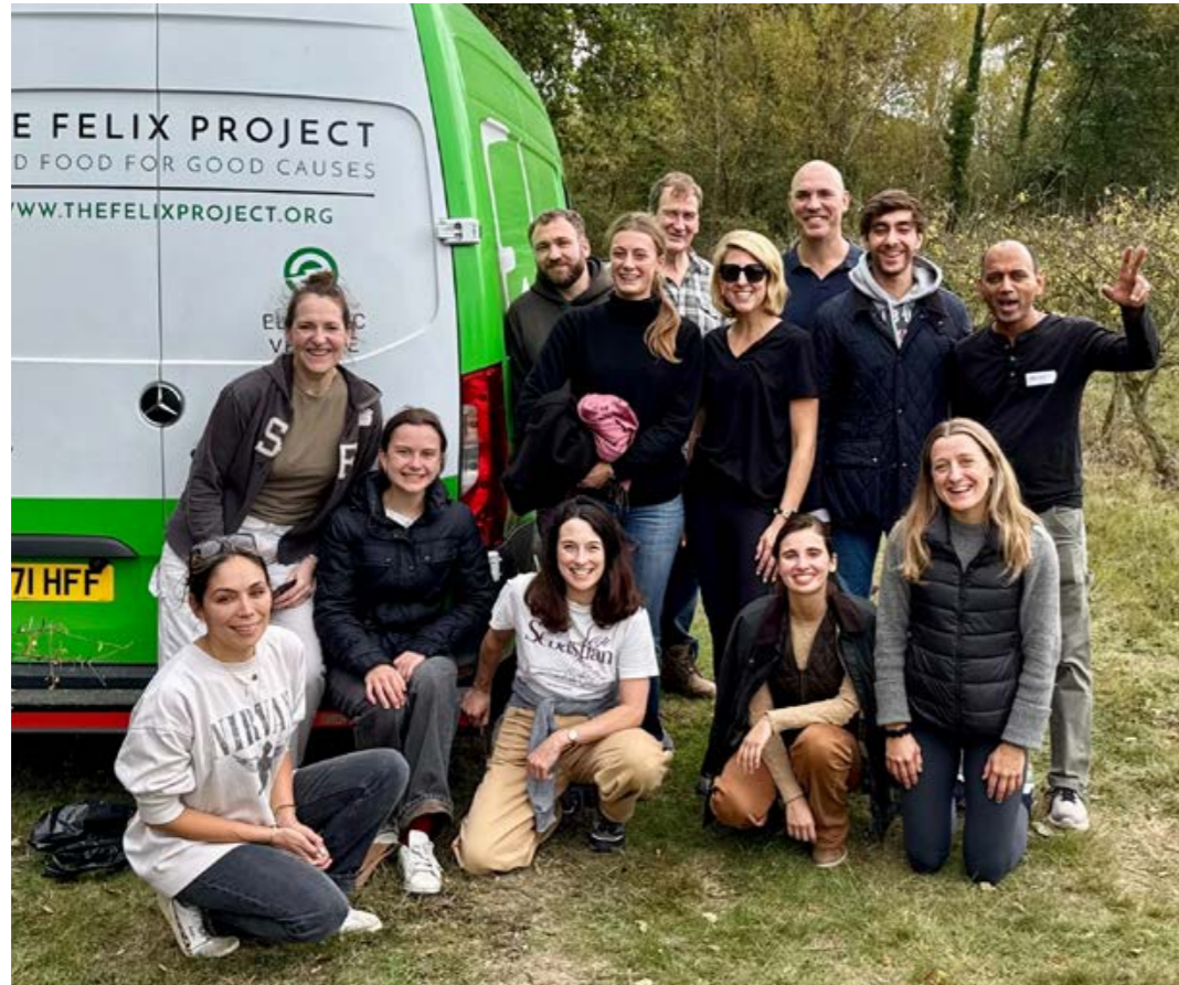
Colleagues from the London office joined 750 volunteers to harvest over 100 tonnes of fruit at three orchards. The produce was distributed to 1,200 charities and schools, supporting the Felix Project's mission to reduce food waste and aid those in need.

Staff engagement activities are coordinated by dedicated employee committees, which identify local projects that the Foundation can support through a donation and where employees can contribute through volunteering.