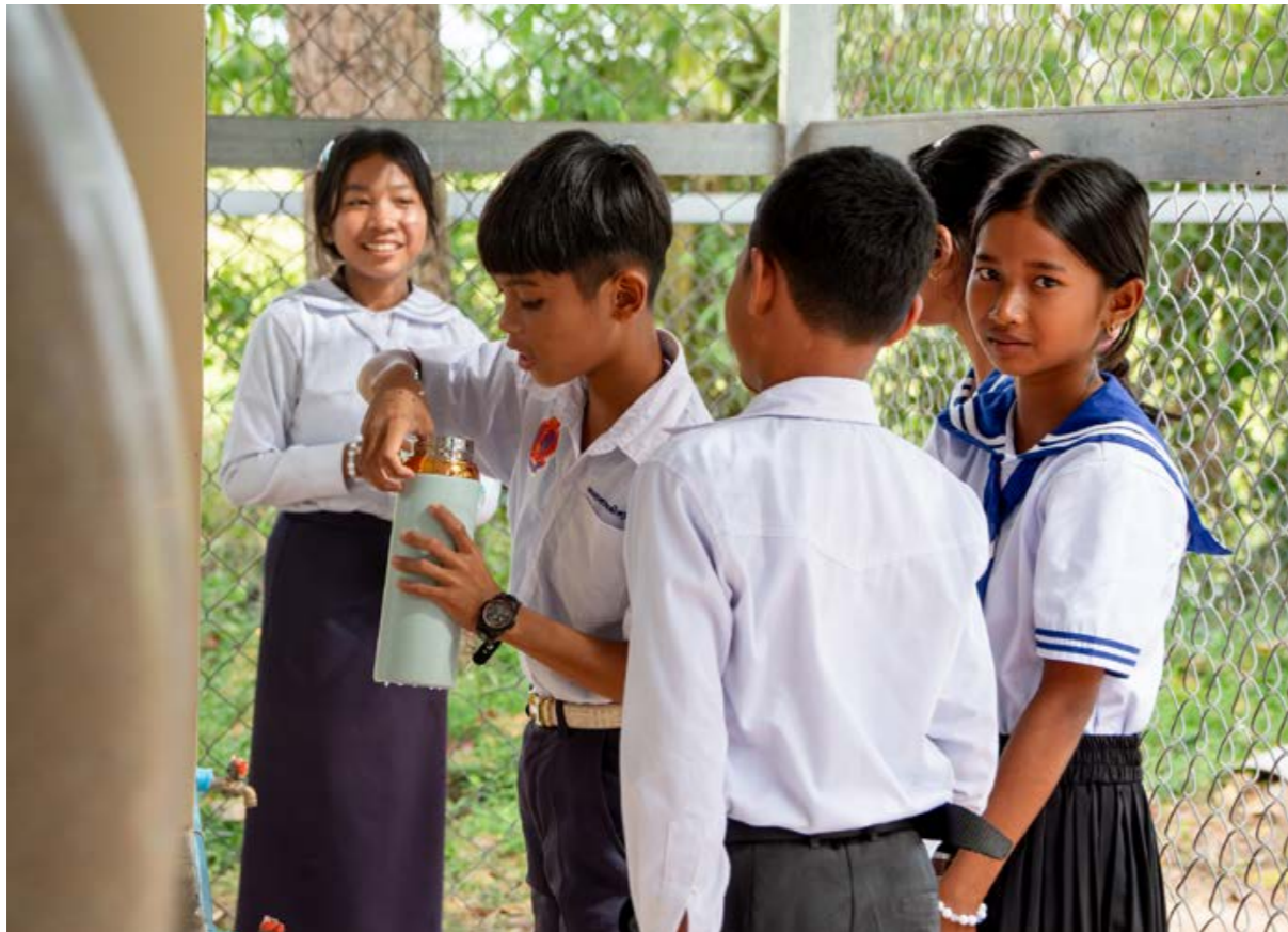
Clear Cambodia, charity: water's local partner in Cambodia, has installed a large-scale biosand filter, adequate

31 water projects funded in Cambodia and Bangladesh, changing the lives of more than 10,500 people.