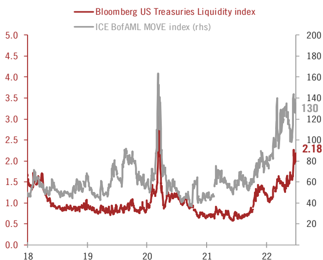
CHART 1: US TREASURY LIQUIDITY AND VOLATILITY INDICES

Source: Pictet's wealth management division - CIO Office & Macro Research, Bloomberg Finance L.P., 29.06.2022