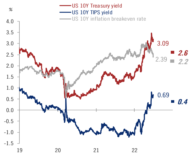
CHART 2: US 10-YEAR TREASURY YIELD WITH YEAR-END FORECASTS

Source: Pictet's wealth management division - CIO Office & Macro Research, Bloomberg Finance L.P., 29.06.2022