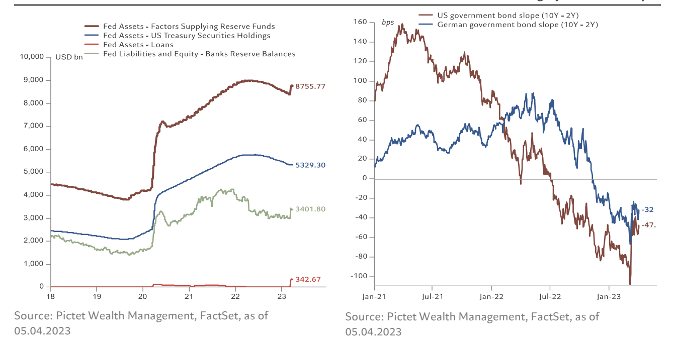
Chart 3: US and German sovereign yield curve slope