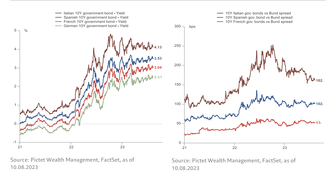
Chart 3: Euro 10-year sovereign bond spreads

Despite wider Italian sovereign bond spreads around the time of the 2022 Italian general election, better-than-expected economic growth in Italy along with relative government fiscal conservatism has assuaged somewhat market participants' concerns about Italy's public debt dynamics. This could come as a surprise given the ECB's aggressive rate-hiking cycle since last year. Indeed, policy rate increases have contributed to pushing the 10-year Italian government bond (BTP) yield above 4% (from below 1% in late 2021), increasing the government's interest payment burden. In 2022, interest payments reached EUR83.2 bn (4.4% of GDP), an amount only slightly below levels that Italy was paying during the 2012 euro sovereign debt crisis.