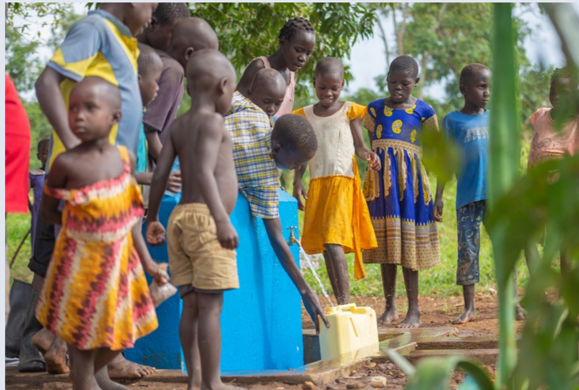
Lack of access to safe drinking water in Uganda causes health problems in children that lead to absenteeism from school.

By November 2023, with support from the Pictet Group Foundation, Africa Water Solutions had brought improved access to water and sanitation to 4,200 households, six schools and three health centres. The transformative effect is apparent as communities gain confidence in their ability to improve their lives.